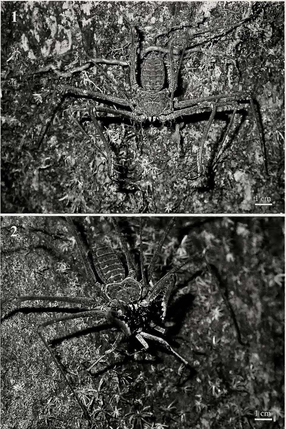
Figures 1–2.—1. Adult female of Heterophrynus longicornis in a typical hunting position facing downward on a tree trunk in Central Amazon; 2. Female of H. longicornis preying on a ctenid spider that climbed the tree trunk at night.